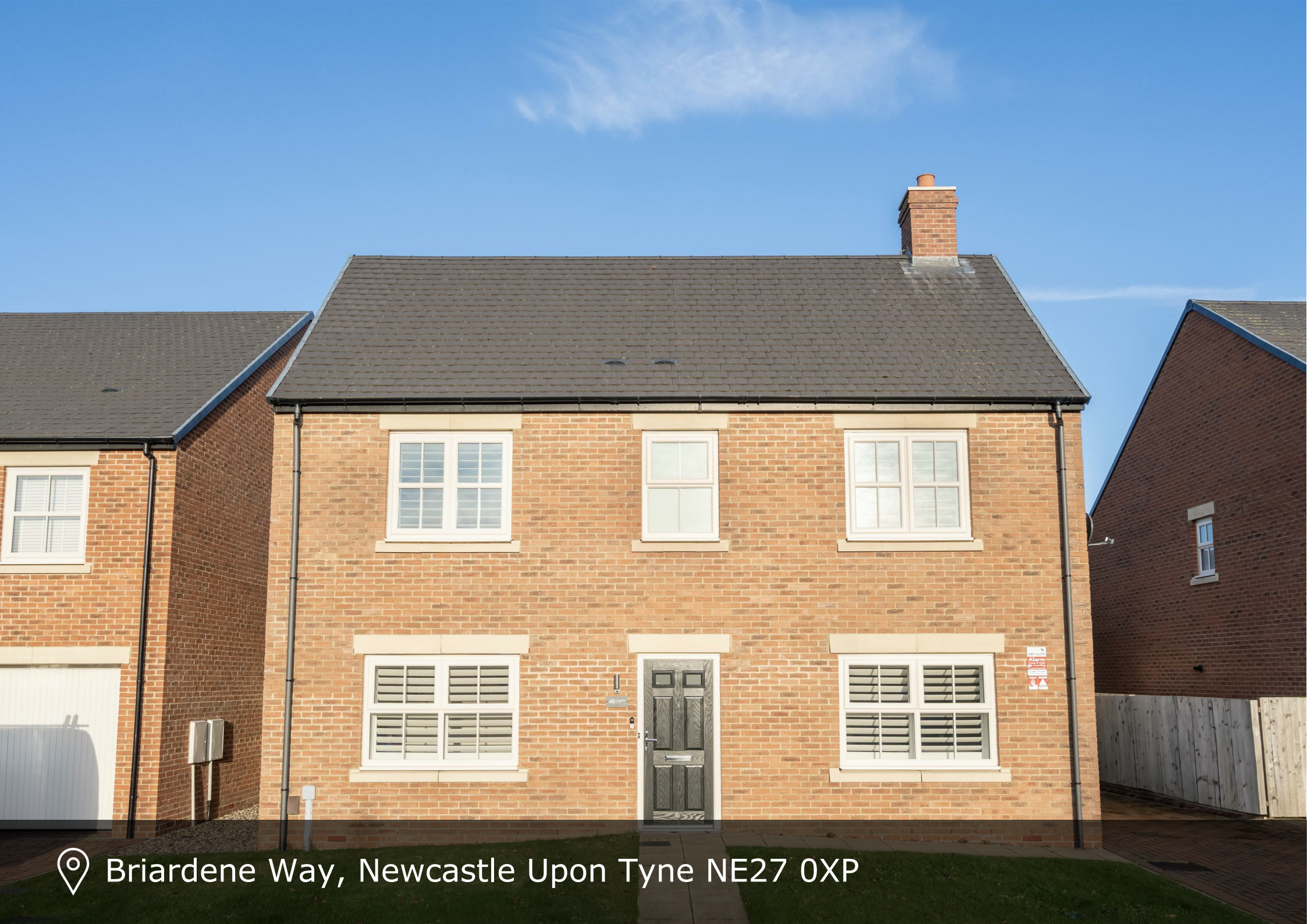
📍 Briardene Way, Newcastle Upon Tyne NE27 0XP